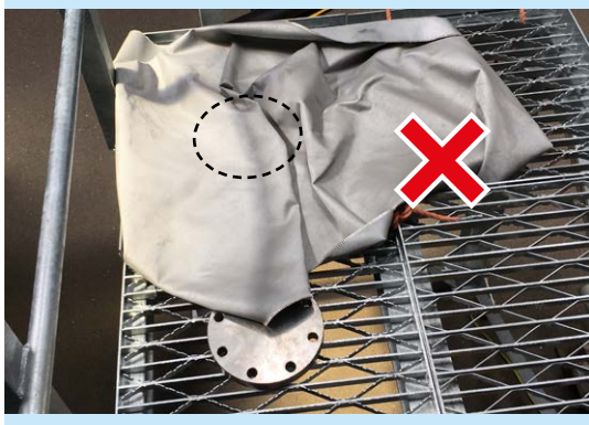
A hole with its cover removed is not visible beneath this cloth. A potential safety hazard.

The mat is transparent, so holes or other hazards beneath it can easily be spotted and avoided.